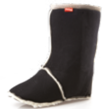
Use with ID502 liner

The removable liner means during breaks the operator can swap their liners out for a dry pair before the next shift benefitting foot hygiene dramatically and also promoting the longevity of the boot.